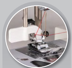
AUTOMATIC NEEDLE THREADER