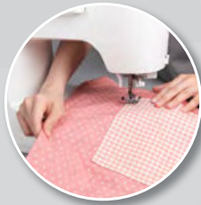
WIDE WORKING SPACE