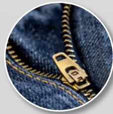
SEWING A ZIPPER