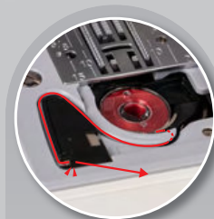
HORIZONTAL DROP-IN BOBBIN SYSTEM