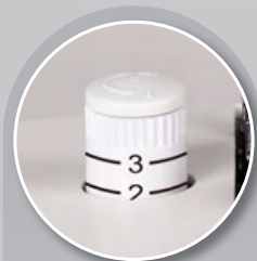
ADJUSTABLE PRESSER FOOT PRESSURE